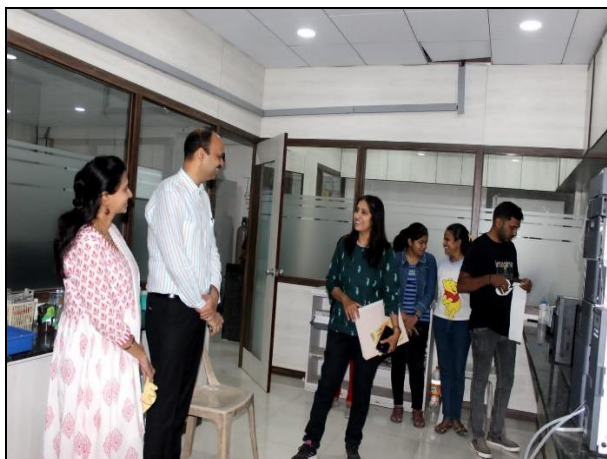
Visit to the Central Instrumentation Facility