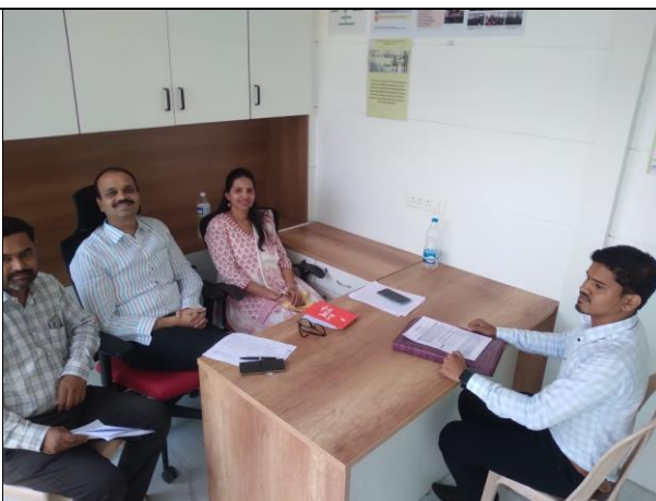
College Placement Cell, Students Interview