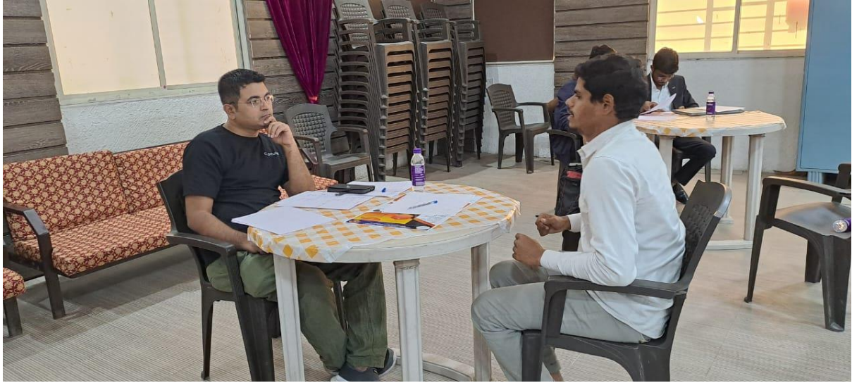
Mock Interview of PG students